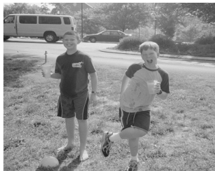
Water Games at Camp!

We also go to camp each summer. This year, from June 11-14, we will be going to Student Life for Kids Camp at Lee University in Cleveland, TN. Children's camp is for children who are in the 3rd-6th grade.