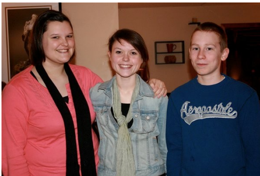
We provide students and their families many opportunities for Christ-centered fellowship to encourage them in their Christian walk.

Students have many opportunities to grow deeper in their walk with Christ at Grace. We offer a dynamic student worship service on Wednesday nights, Oasis. Sunday morning small groups teach students the truth of God's Word and how to apply it to their life. Students who desire to grow even deeper in their walk can be a part of a ministry team or discipleship group through the week. We also offer other special ministry events and trips to grow them in their faith and to strengthen our community of believers.